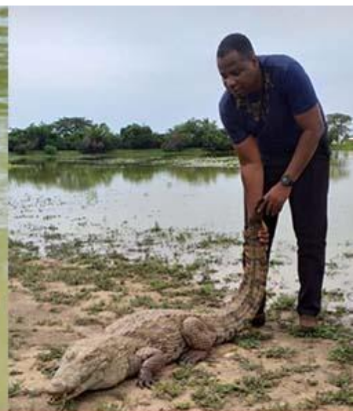
Paga Crocodile Pond